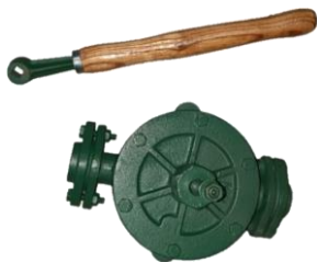
1 1/4" Wing Pump