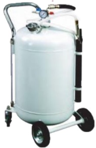
Pneumatic Oil Dispenser 65L