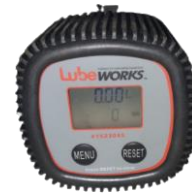
IMEX Digital Meter Size: 1/2" Product: Diesel / Oil Pressure: 100BAR