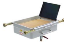
Oil Pit Drainer 65L With Hose Holder