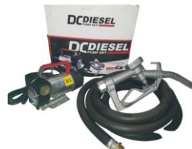
24v Diesel Kit Includes: - Hose - Manual Nozzle