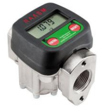
Oil and Windshield washing Digital Meter Size: 1" Flowrate: 100Lmin