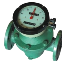
Oval Gear Meter Size 3" Cast Iron Product: Diesel / Oil