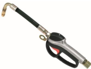
Oil Gun Aluminium Flexible Spout Inlet: 1/2"