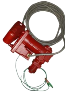
1" FILRITE Pump Diesel / Petrol 24v