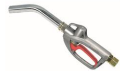
Oil Gun Rigid Spout Size: 3/4" Flowrate: 90Lmin