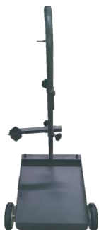
Drum Trolley 20 - 60Kg