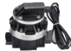
Oval Gear Pulse Meter Size: 1"